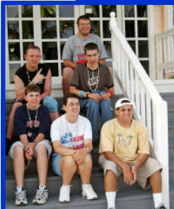
2006 Campers at Little Cayman Beach Resort

Using a nationwide force of concerned volunteers armed with a variety of educational tools, the Foundation will fund and organize specific programs that will help young people become more aware and interested in the aquatic environment.