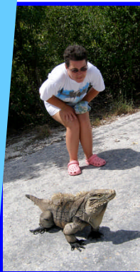
Visiting with the iguanas