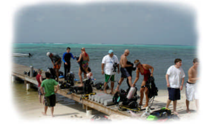
Preparing for 1st (shore) dive